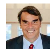
Tim Draper Founder Draper Associates